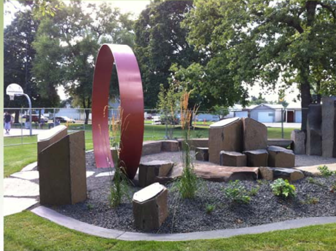
The New Gathering Place Monument in Chief Garry Park

On August 24 th the Spokane Tribe of Indians and the City of Spokane dedicated the new Chief Spokane Garry Monument in Chief Garry Park.