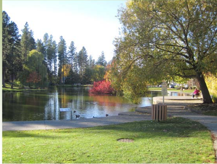
Mirror Pond in Manito Park