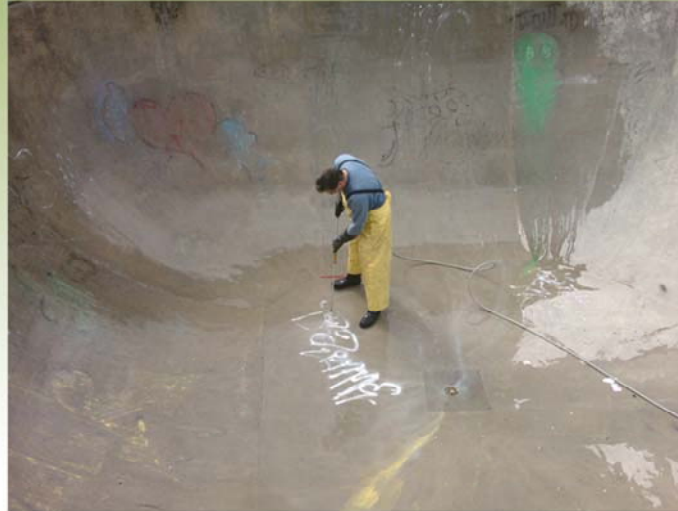
Graffiti removal at the Hillyard Skate Park

Park Operations estimates $50,000 a year in materials and supplies related to vandalism with money also spent on security systems and patrols.