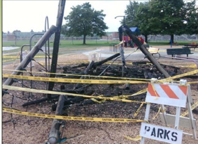
Shadle Park Play Structure – August 28th

This burnt-out playground structure at Shadle Park was discovered the morning of Sunday, August 28. Police and Fire are investigating.