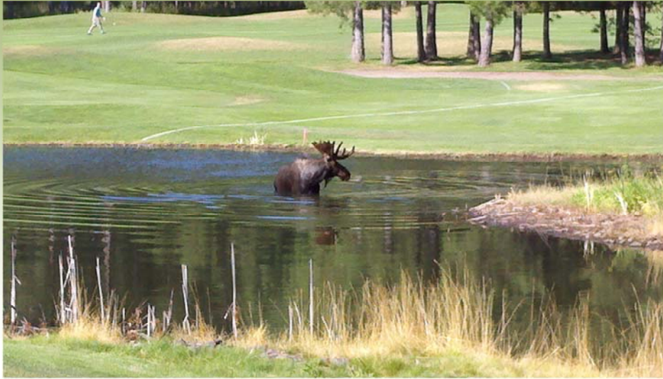
Moose on the loose at Qualchan

Here's something you don't see everyday.