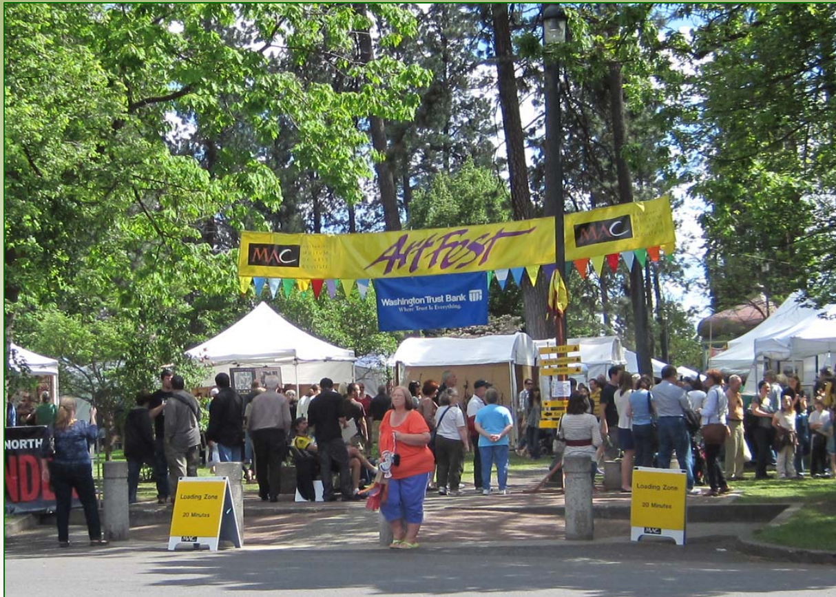
ArtFest in Coeur d'Alene Park - June 4, 5 & 6 th “Make It Art” sponsored by Parks and Recreation.