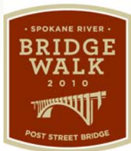
2010 Featured Bridge – Post Street