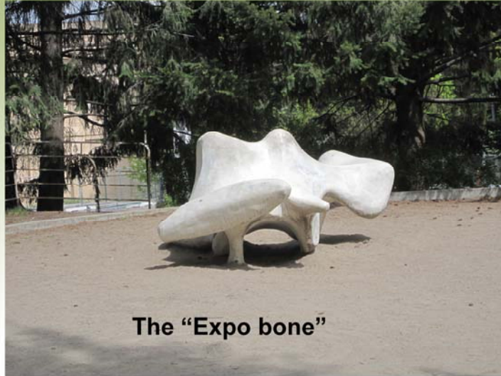
The “Expo bone”

In case you’ve been wondering, we have an update regarding the Expo sculpture in Riverfront Park: