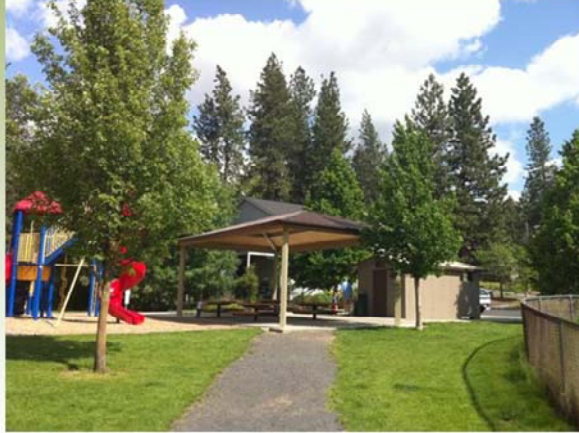
Polly Judd "Pancake Shelter" Completed

The new Polly Judd "Pancake" Shelter is completed and will host its first pancake feed the third weekend of June.