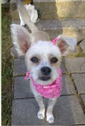
Charlotte is dressed and ready to go to the dog park!